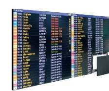
Indoor LED Signage