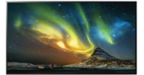
OLED Wallpaper TV (except US)